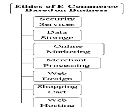
Fig 2: Ethics of E-commerce based on business

Therefore biggest advantage of E-Commerce is the ability to provide secure shopping transactions via the internet and coupled with almost instant verification and validation of credit card transactions. This has caused E-Commerce sites to explode as they cost much less than a store front in a town and has the ability to serve many more customers. The basic ethical component of e-commerce based on business given fig 2.