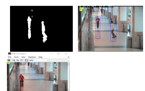
Figure 1 Shows (a) original frame (b) Foreground Detected (c) Clean Foreground after noise removal (d) Detected objects (e)Real Time object detection video play CAVIAR [11] database sample (indoor)